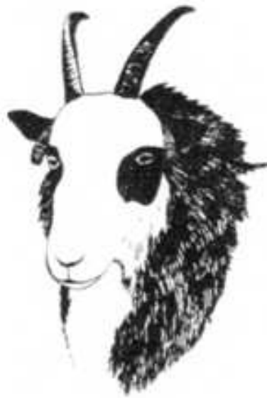
FIG. 2 - A weakening of this factor causes Panda eye patches, and lambs with badly misshaped faces should not be registered