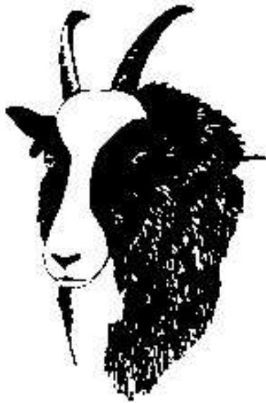
FIG. 1 - It is desirable that there should be a blaze with even cheeks